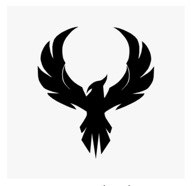
BLACK PHOENIX (BPX) Black Paper